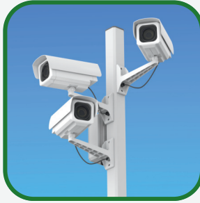
SECURITY CABIN & CCTV