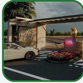
ENTRY EXIT GATE